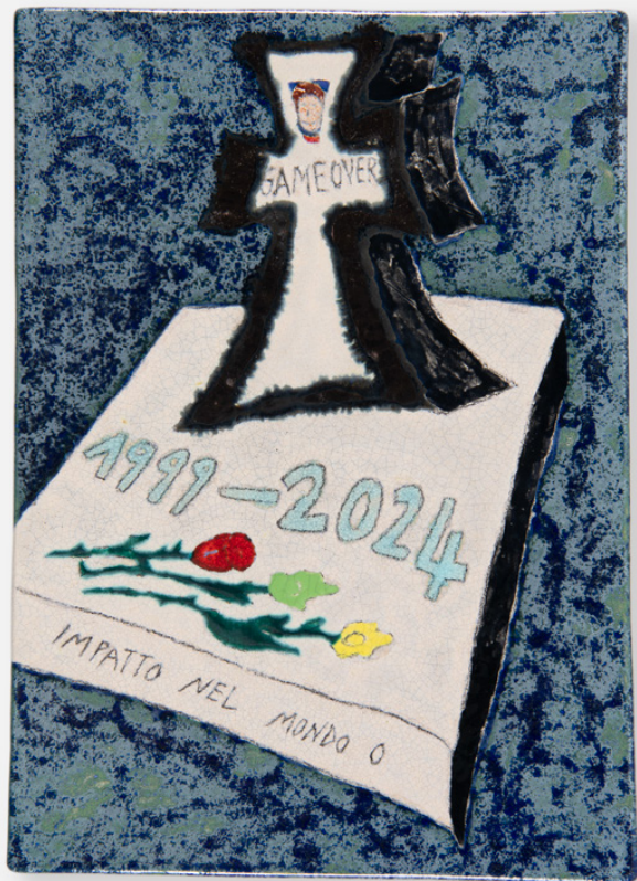
Mi sento vuoto, A3 x 2cm, glazed ceramics.