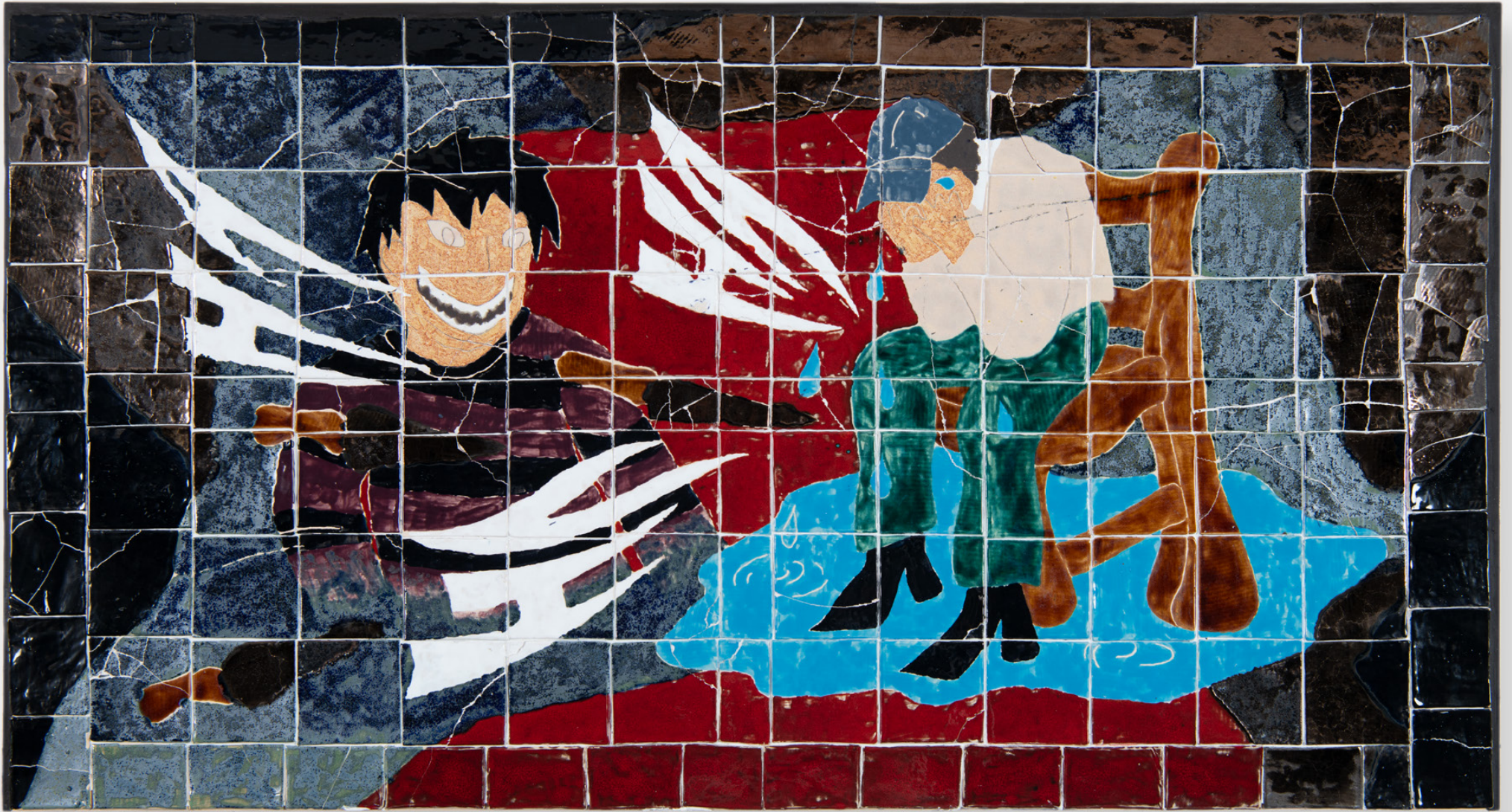
Details of the roof, glazed ceramics tiles, 165x100cm.