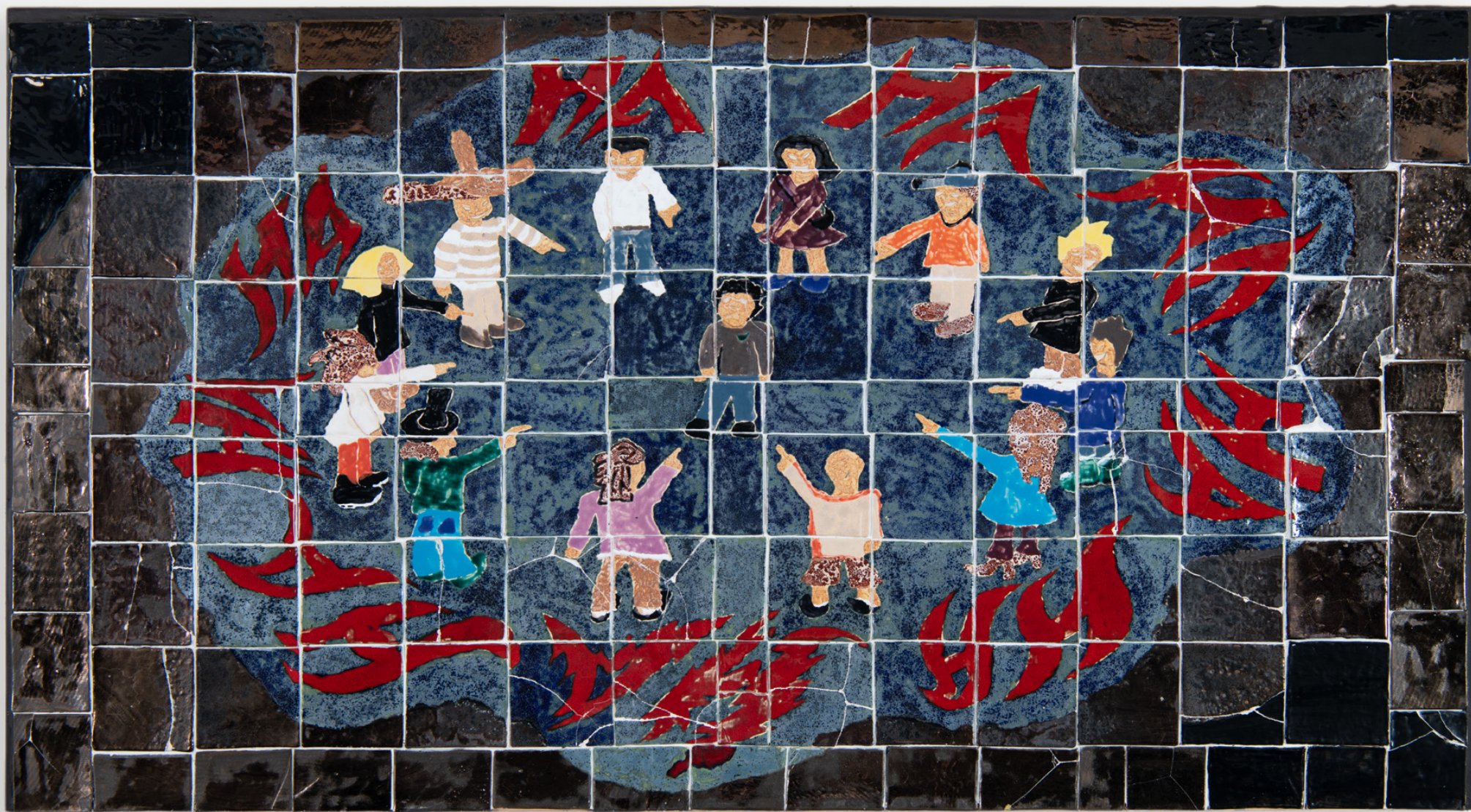
Details of the roof, glazed ceramics tiles, 165x100cm.