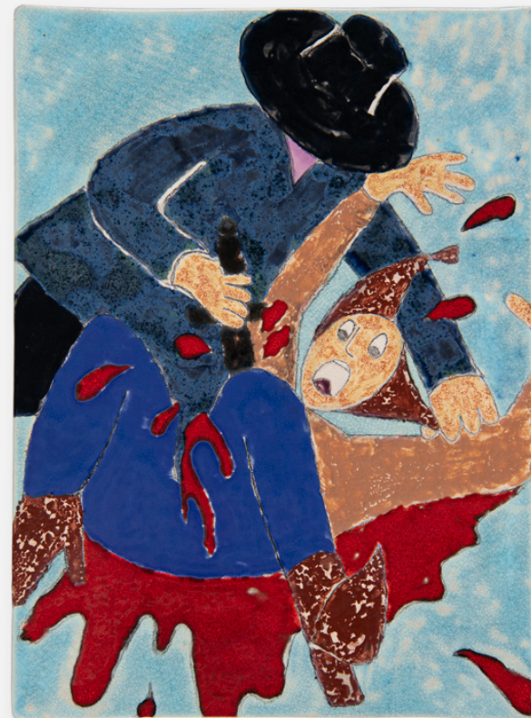
Le tue parole mi feriscono, A3 x 2cm, glazed ceramics.